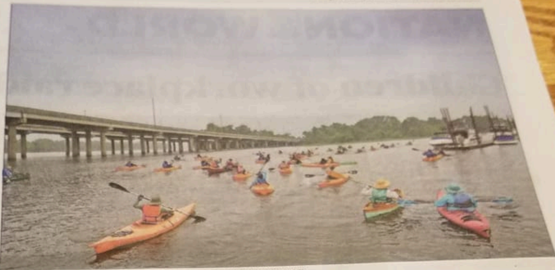
Kayakers paddle onto the river.

About 60 members of the Delaware River Sojourn paddled over Crosswicks Creek in Bordentown Township on Saturday during the finale to an eight-day journey along the Delaware River. After the trip along the river, Sojourners stopped at John A. Roebling Park and the Tulpehaking Nature Center in Mercer County for lunch and an awards ceremony for members.