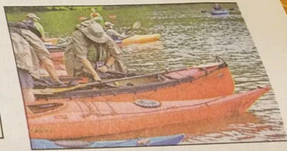
A woman prepares her canoe for the river.